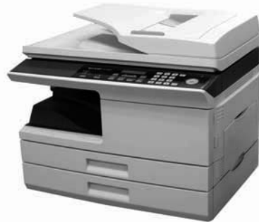
Models: AL-2030, AL-2040CS, AL-2050CS

This offer may not be combined with any other rebate & does not apply to purchases at Staples, Staples.com or membership warehouse clubs